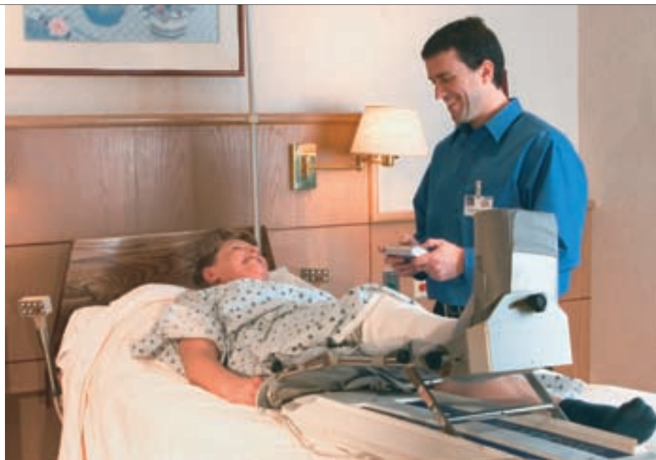
We provide personalized care before, during and after all our surgeries.

NEW! TREATMENT FOR HEAVY PERIODS One in five women experiences heavy periods. The situation can